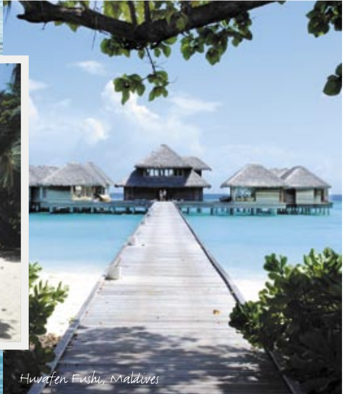
Huvafen Fushi, Maldives