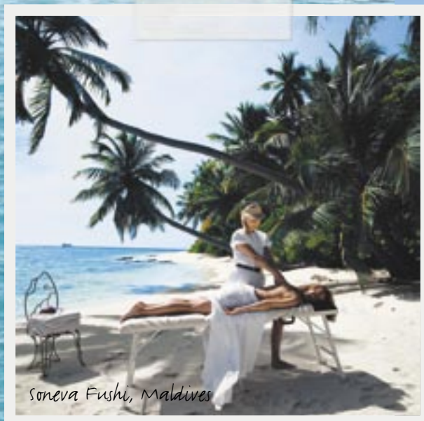
Soneva Fushi, Maldives