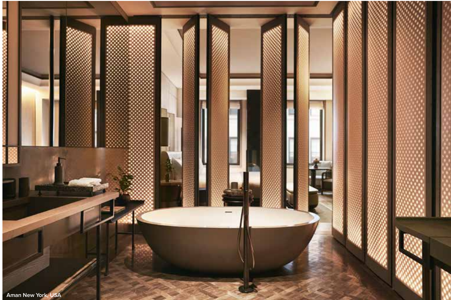
Aman New York, USA