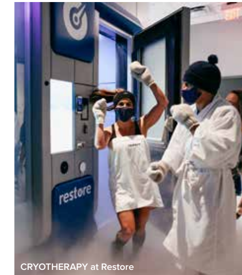
CRYOTHERAPY at Restore

Modrn Sanctuary offer a trilogy of advanced technologies to slow down aging and short circuit the body's repairing process. These include the 'Himalayan Salt Room' (Halotherapy) and 'Oxygen Bar' for boosting oxygen health, 'Infrared Salt Sauna' to fast-track detoxification and the 'Somadome