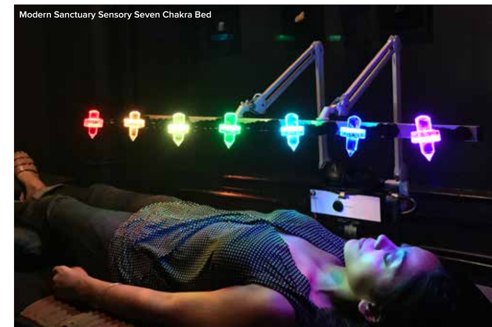
Modern Sanctuary Sensory Seven Chakra Bed

The Fuel Stop is an urban 'bionic' advanced wellness brand with locations in both New York and Miami. It's one of the few wellness spas in the city offering the high-level double chamber natural air full immersion 'Cryochamber' considered the best model on the market. Cryotherapy essentially involves exposing the body to short bursts of sub-zero temperature that pushes the body