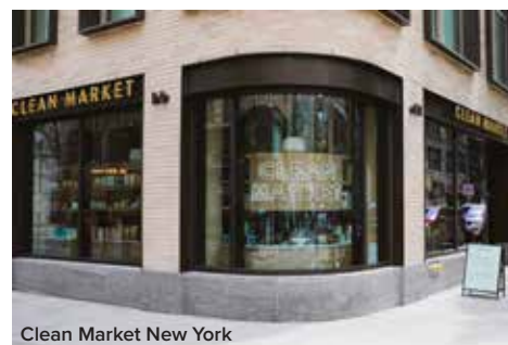
Clean Market New York

Wellness for high doses of recalibrating wellness. The menu here includes Infrared Sauna , Red Light Therapy , and Compression with Cryotherapy and IV Therapy the most sought-after. IV therapy is essentially an infusion of fluids with essential vitamins, nutrients, minerals, and amino acids that helps to combat internal diseases. The ' Mild Hyperbaric Oxygen Chamber ' is a pressurized chamber where high amounts of oxygen penetrate the body's tissues, blood, and brain. Recently, this has become very popular for treating Long Covid-19 as it is effective for boosting