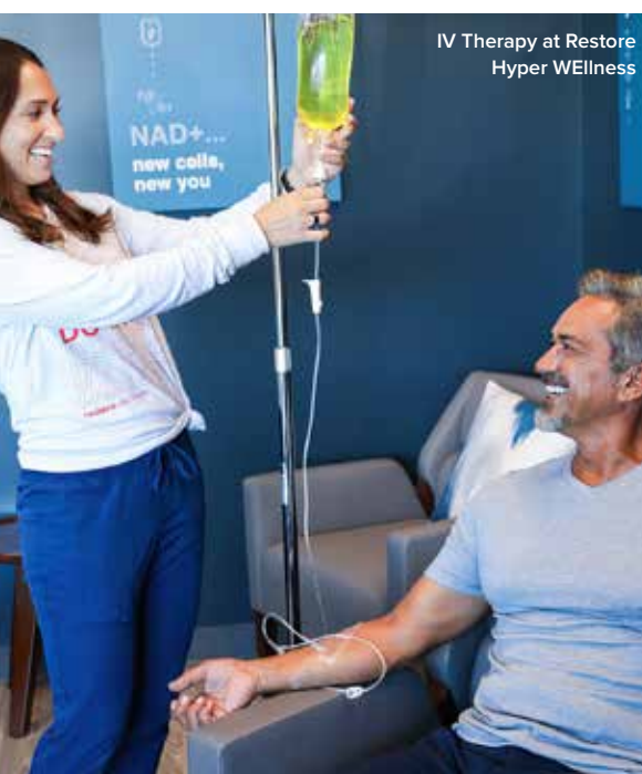
IV Therapy at Restore Hyper WEllness

Athlete's, marathon runners and health-minded folk also head to Restore Hyper