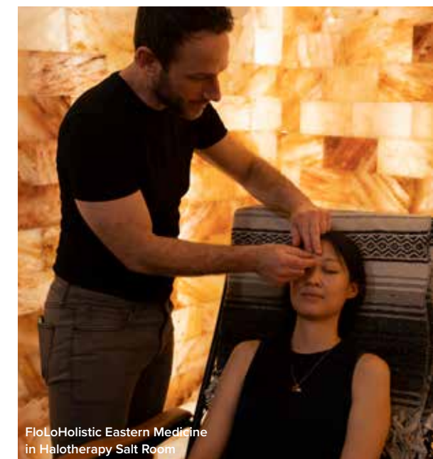
FloLoHolistic Eastern Medicine in Halotherapy Salt Room