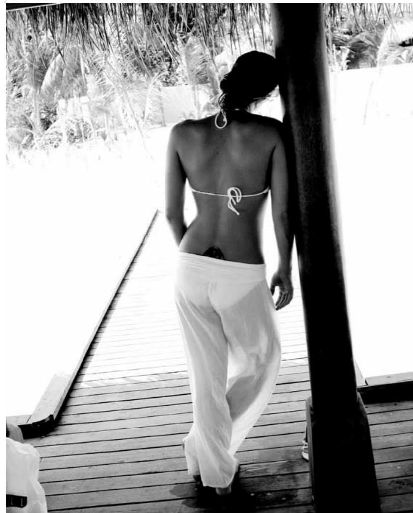
BALANCING ACT Taking in the serene surrounds of Huvafen Fushi in the Maldives, above. Right: The overwater yoga pavilion at the same resort.