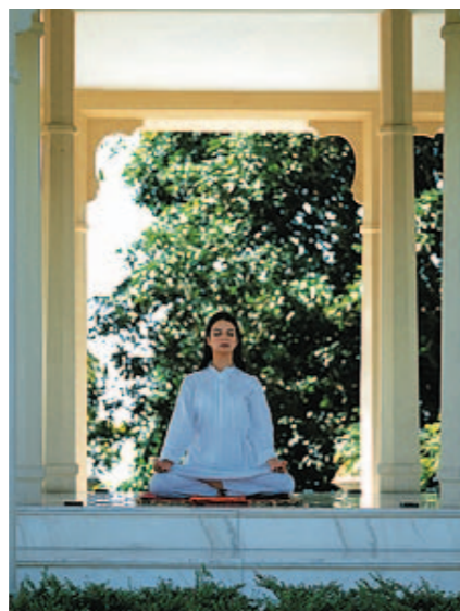
ASSUME THE POSITION Clockwise from above: Meditating at Ananda in the Himalayas; a yoga session at the Farm at San Benito; Life Wellness Resort Quy Nhon. Opposite: The Yoga Barn at the Four Seasons Chiang Mai.

offers distractions aplenty, from an 18-hole golf course and well-equipped spa to views across the rolling countryside. Those who come for yoga won't be disappointed either; classes combine traditional techniques with Pranyama (breathing exercises) and meditation, and are given in a pavilion that looks out on a small lake